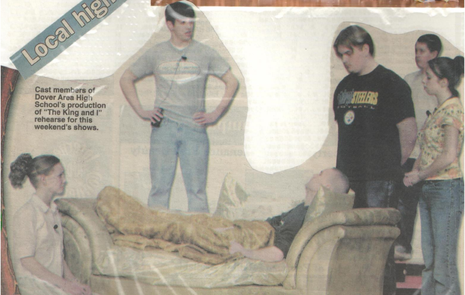
Cast members of Dover Area High School's production of "The King and I" rehearse for this weekend's shows.